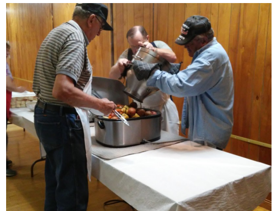
Cooks from the Eagles who prepared the Cream Can Dinner!!